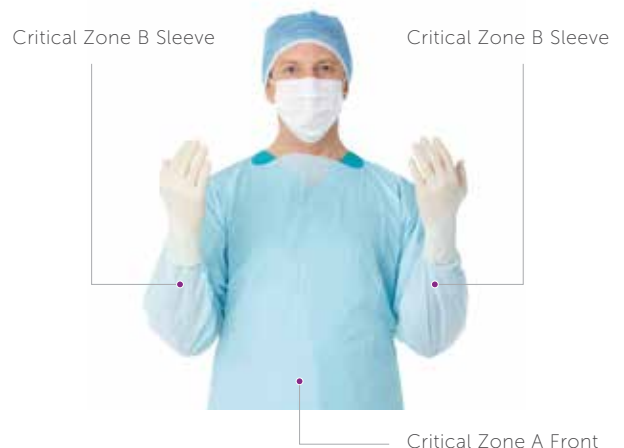
Figure 2. AAMI Surgical Gown Classification 8, 9